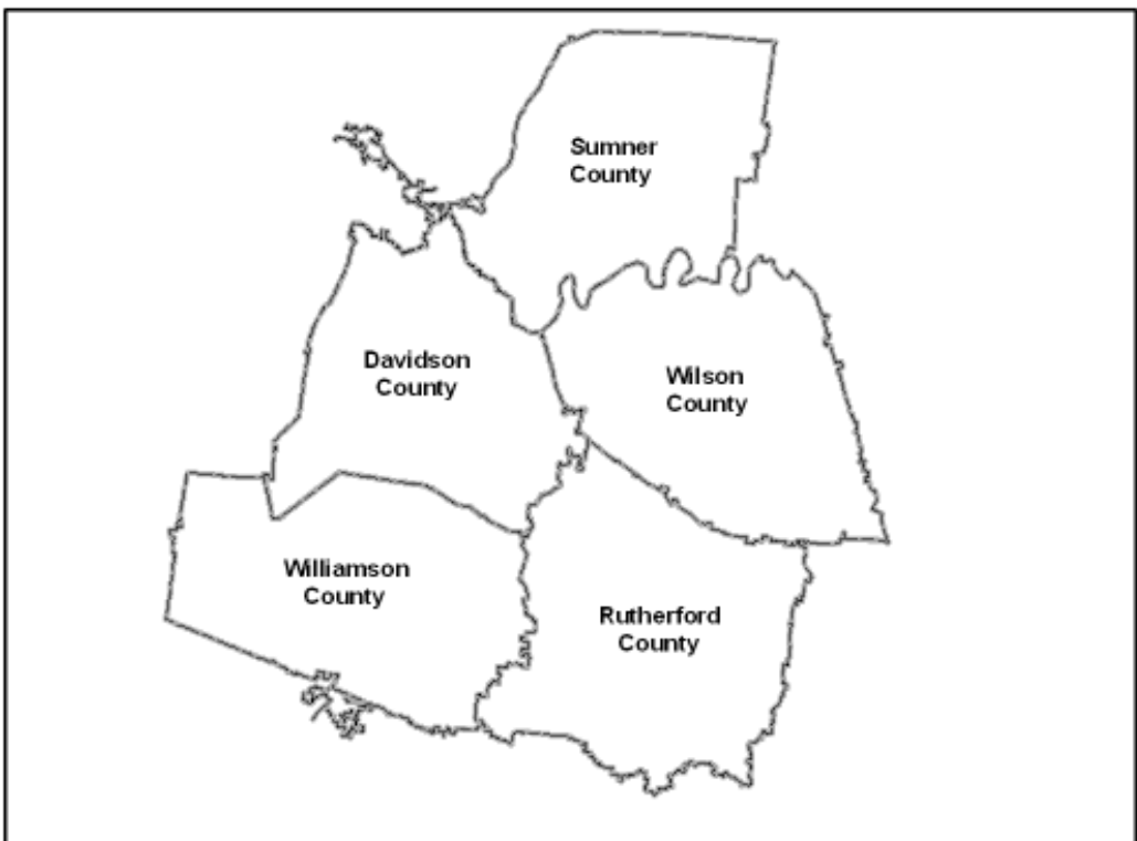
This map is for illustrative purposes only. Drawings depict conceptual project corridors and areas, not approved alignments.