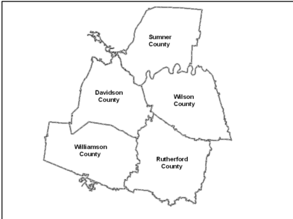
This map is for illustrative purposes only. Drawings depict conceptual project corridors and areas, not approved alignments.