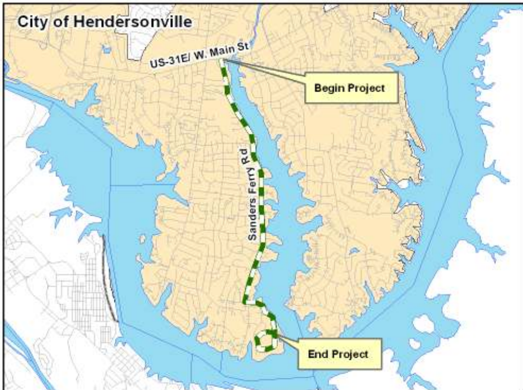
This map is for illustrative purposes only. Drawings depict conceptual project corridors and areas, not approved alignments.