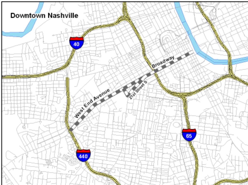
This map is for illustrative purposes only. Drawings depict conceptual project corridors and areas, not approved alignments.