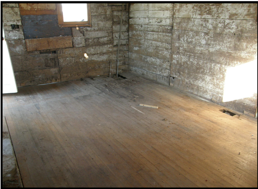
Room E107 former Kitchen – will be main entrance room for house once restoration is complete Pic 12/15/2012