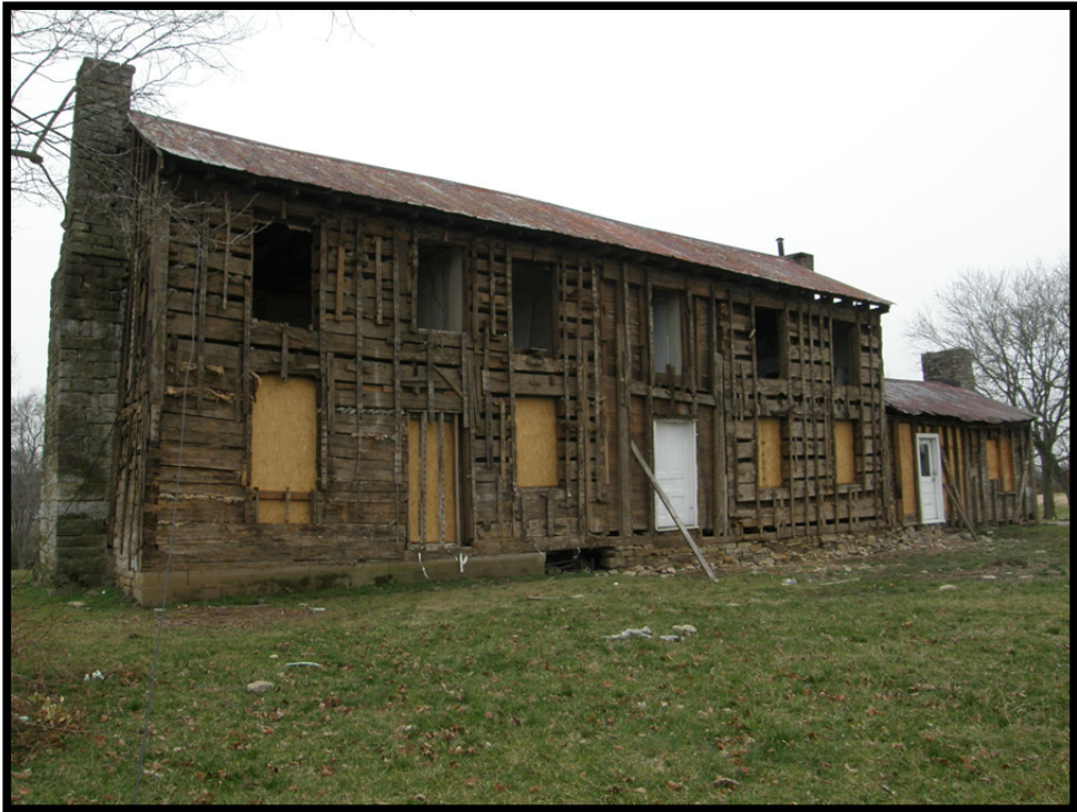
Above: Exterior photo post lead and asbestos removal – West Side of house - Picture taken February 10, 2012.