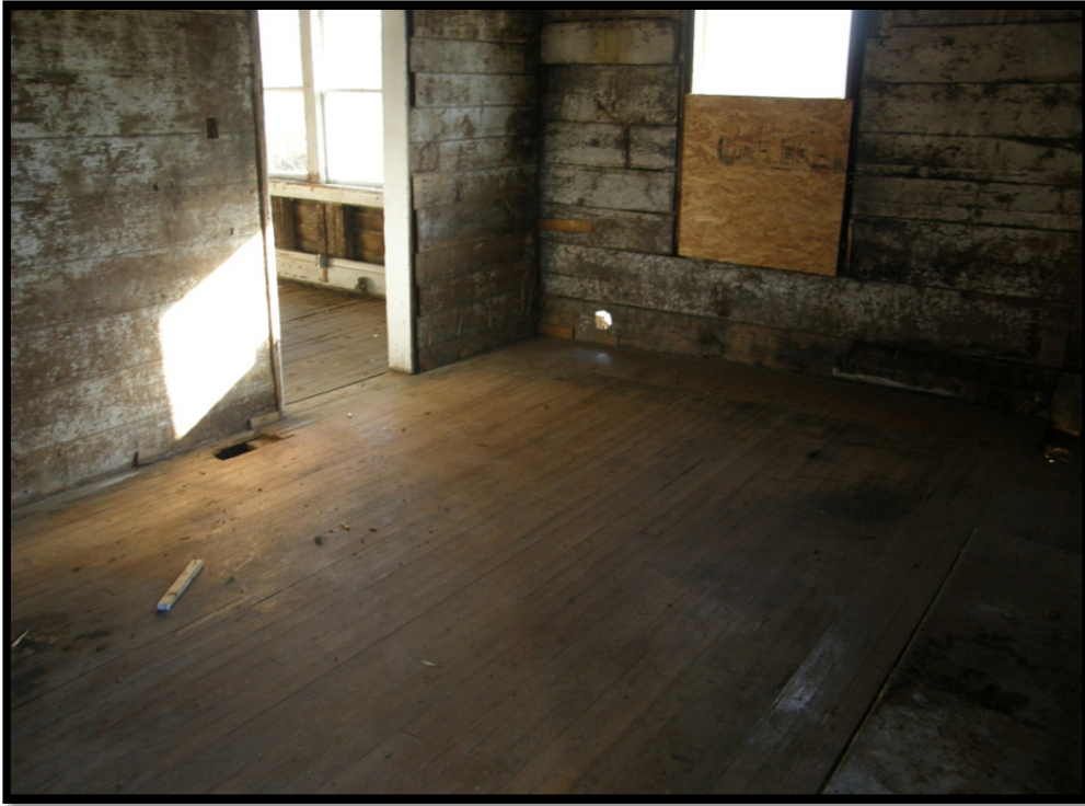
Room E107 former Kitchen, will be main entrance room for house once restoration is complete. Pic 12/15/2012