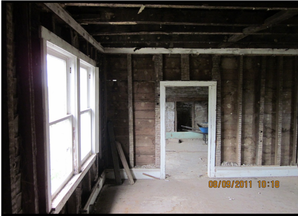
Room E106 potential display area – Picture from 8/9/2011