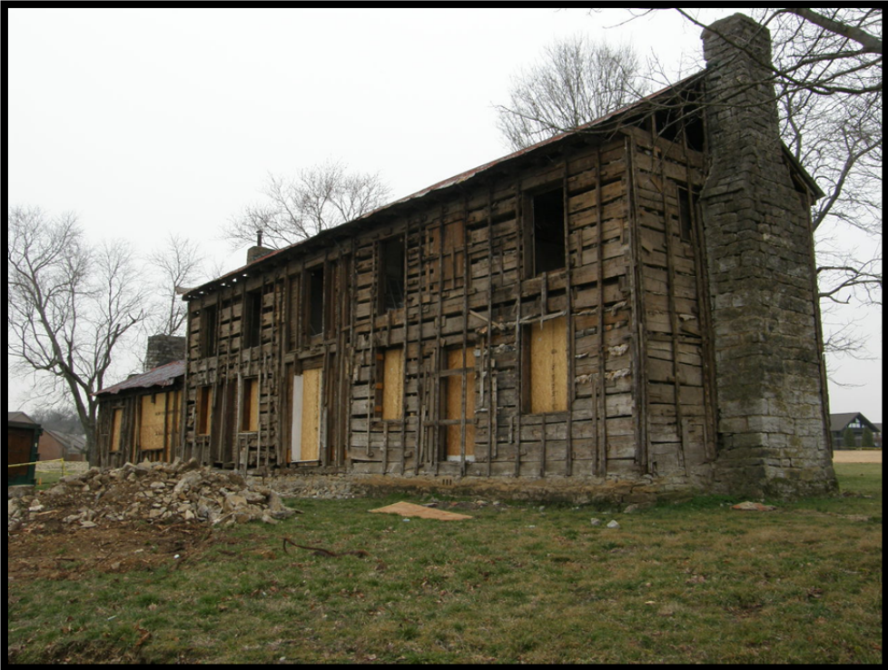
Above: Exterior photo post lead and asbestos removal – East Side of House - Picture taken February 10, 2012.