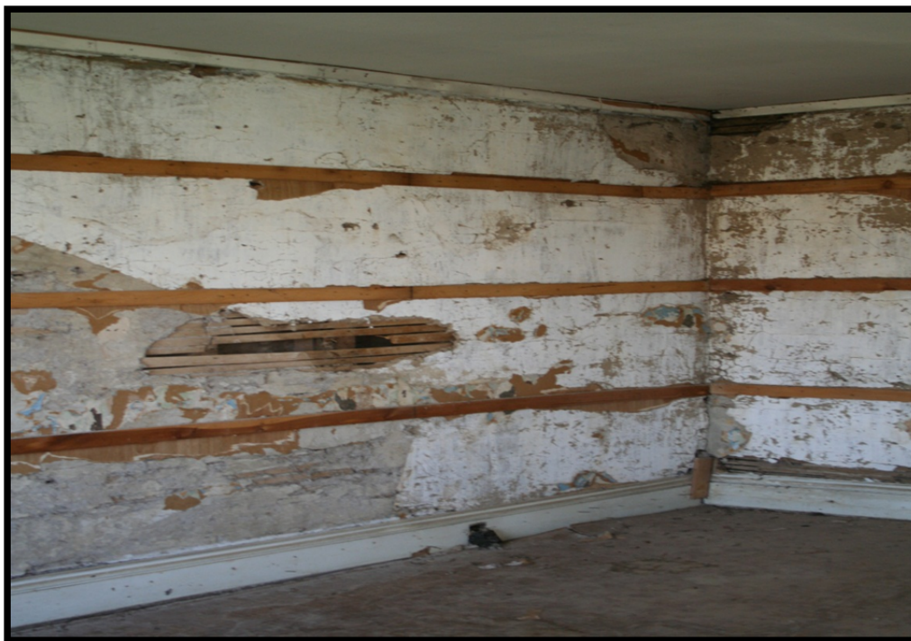
Room E106 potential display area - Picture from spring 2011, Lathe has been removed. See above picture.