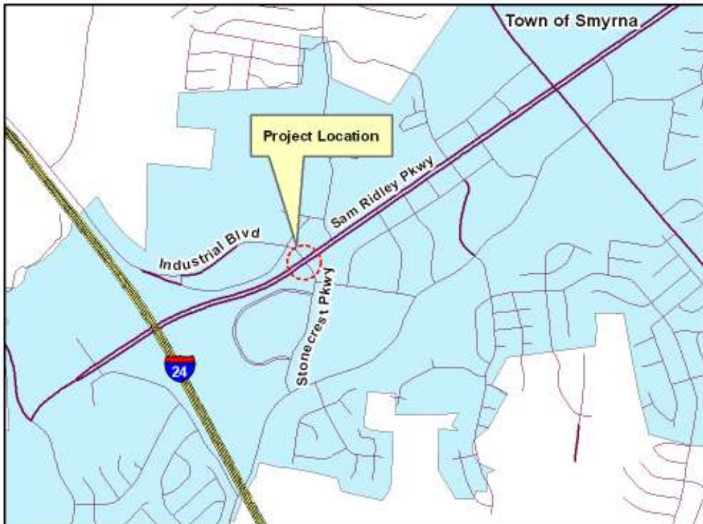
This map is for illustrative purposes only. Drawings depict conceptual project corridors and areas, not approved alignments.