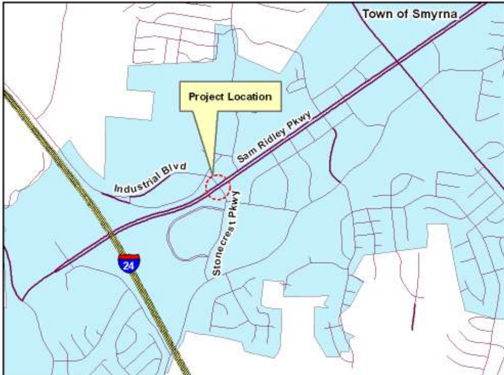
This map is for illustrative purposes only. Drawings depict conceptual project corridors and areas, not approved alignments.